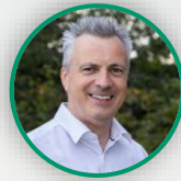
Matt PAYNE ROLLS ROYCE COO