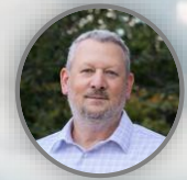
David GRAEBER BOEING